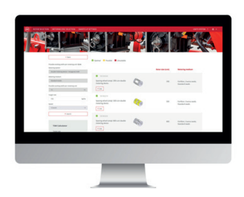
Rotor Selection, Metering Selection and SmartClip Guide