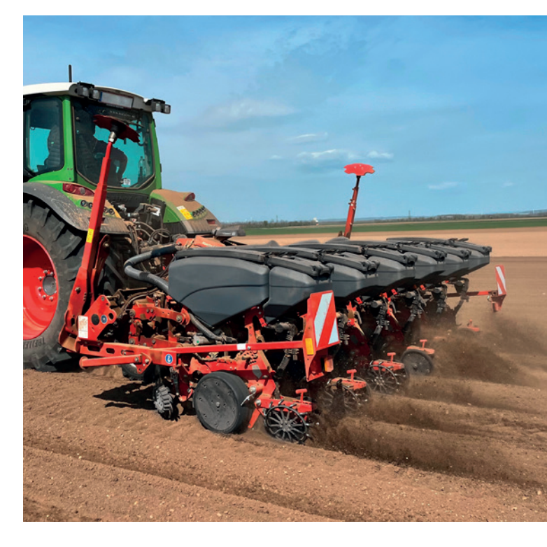
Leeb VT (top) and Maestro TX (above)

"The new Avatar SL and Sprinter SL drills expand these popular ranges to offer proven features at small working widths, while the new Maestro TX features a telescopic frame for a wide variety of row spacings. As always, our goal is to provide the machinery that enables the farmer work the way he wants to, machinery adapted and developed to meet the needs of UK farmers."